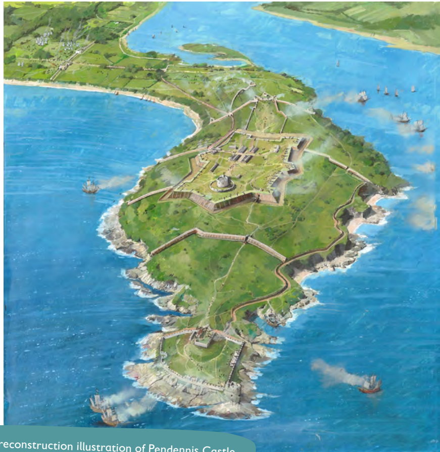
A reconstruction illustration of Pendennis Castle as it may have looked during the siege of 1646.