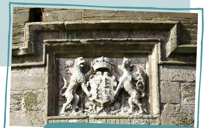
The Royal Arms of England on St Mawes Castle.

This source is a translation of some of the Latin inscriptions on the outside of the Tudor Gun Tower at St Mawes Castle.