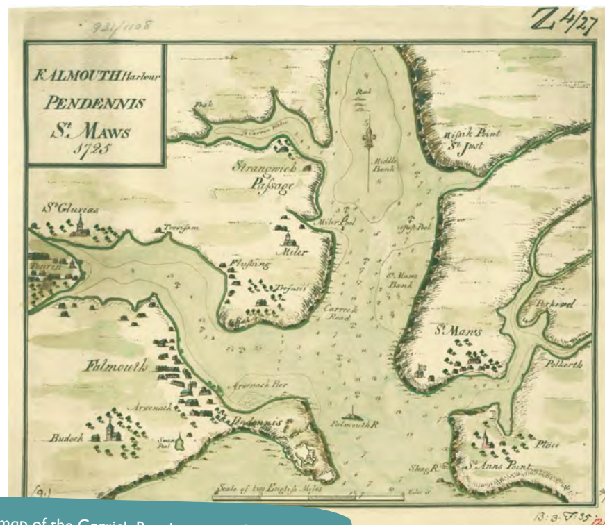
A map of the Carrick Roads estuary from 1725.