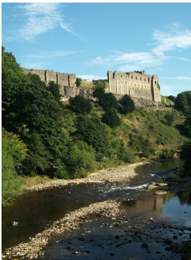
Richmond Castle is built on a ridge overlooking the river Swale.