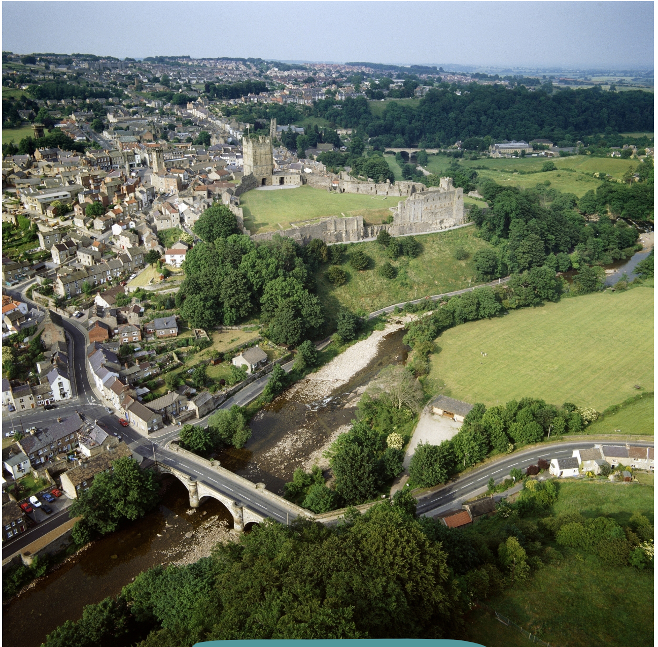
An aerial view of Richmond Castle as it looks today.