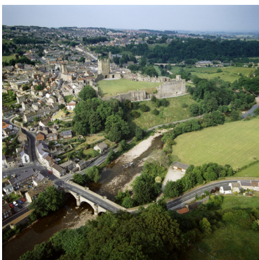
An aerial view of Richmond Castle.