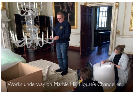
Works underway on Marble Hill House's Chandelier.

As you may have seen, work continues across the park, including archeology in three locations to explore and understand the park's history in a little more detail. More sports pitches have been resurfaced and the children's play area is due to have equipment installed - ready to open alongside the café in 2021. With extra outdoor seating, we hope that the café will be a lovely space to enjoy a hot drink and a bite to eat – and a fantastic way to support the house and park.