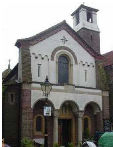
St Anthony of Padua, Rye, which was identified as a potential new listing as a result of the Taking Stock survey in the Catholic diocese of Arundel and Brighton.

Taking Stock is a programme of historical audits of churches, conducted in partnership with dioceses or equivalent bodies. The resulting reports provide an authoritative and objective evaluation of the historical significance, current condition and adaptability of listed and unlisted church buildings that can be integrated into diocesan strategic planning. This sort of information is vital in areas where the pastoral situation means there is pressure either to close churches or adapt them for wider uses.