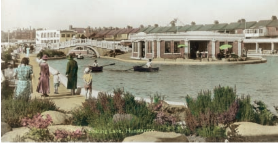
Holidaymakers watch their friends on a boating lake at Hunstanton, Norfolk