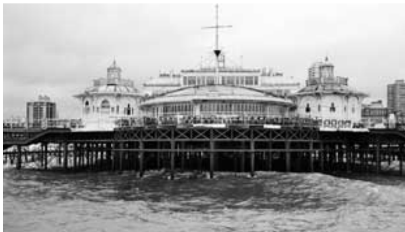
NMR AA70/3223

Casework interventions are inevitably controversial and at times unsuccessful. This has been particularly true in London, where intense development pressures have led to