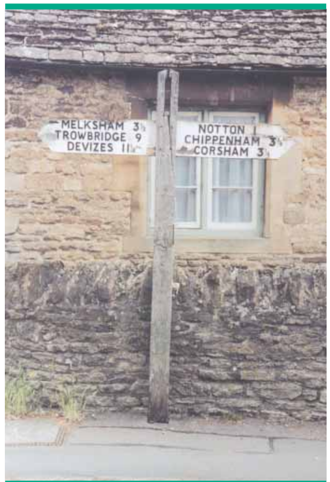
Routine repair and regular maintenance are essential