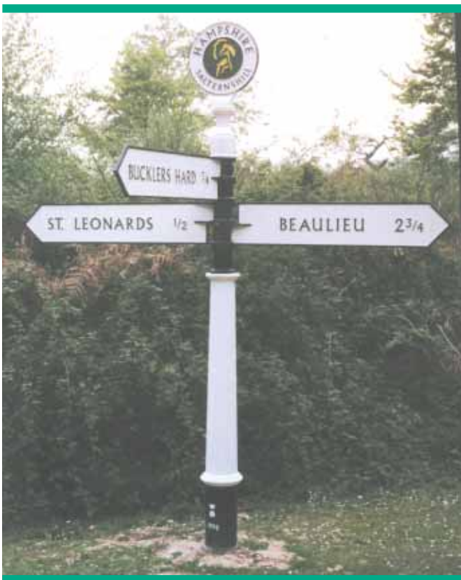
New cast iron fingerpost to traditional design: Salternshill, Hampshire

The original upper case fonts are no longer prescribed and therefore special authorisation is required. Alternatively, Transport Heavy alphabet, as shown on the Newton Longville example (diagram 2141 in the 2002 Regulations) may be used. Chapter 7 of the Traffic Signs Manual includes design guidance. Details of the fonts can be obtained from the Department for Transport. Where new fingerposts are installed, they should replace, not duplicate, existing signs.