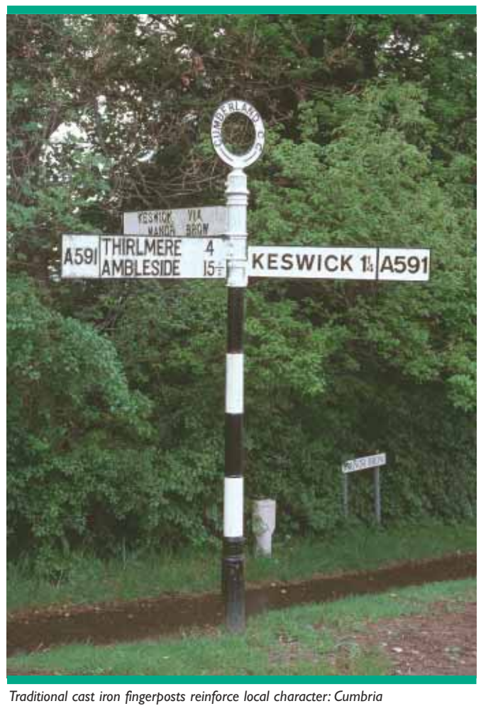
MoT standard pattern 1921