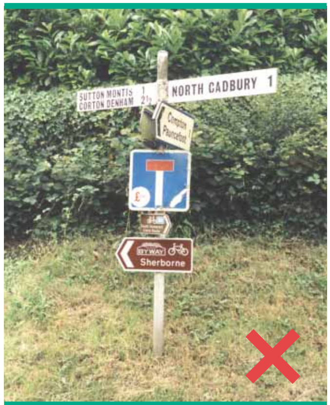
Modern signs and symbols must not be added to fingerposts