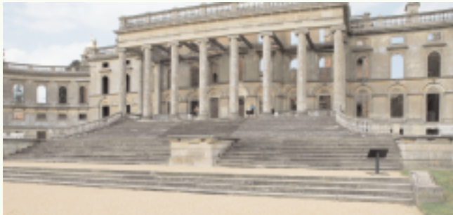
Access to Witley Court via steps only

The house is accessible via steps only, but there are terraces around the house for viewing. Please note there are no toilet facilities near the house and fountains.