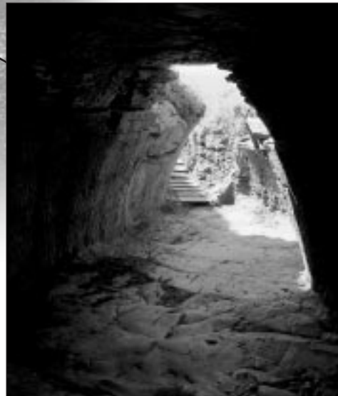
Tunnel Cool larder for storing food Arched ceiling Tool marks

FOLLOW UP: Compile a report on the castle's defences and present them to their peers; write a diary of their adventure as a spy disguised as a servant; or write a poem entitled 'Steps to nowhere' based on the steps in the mainland courtyard. Use the on-site activity: