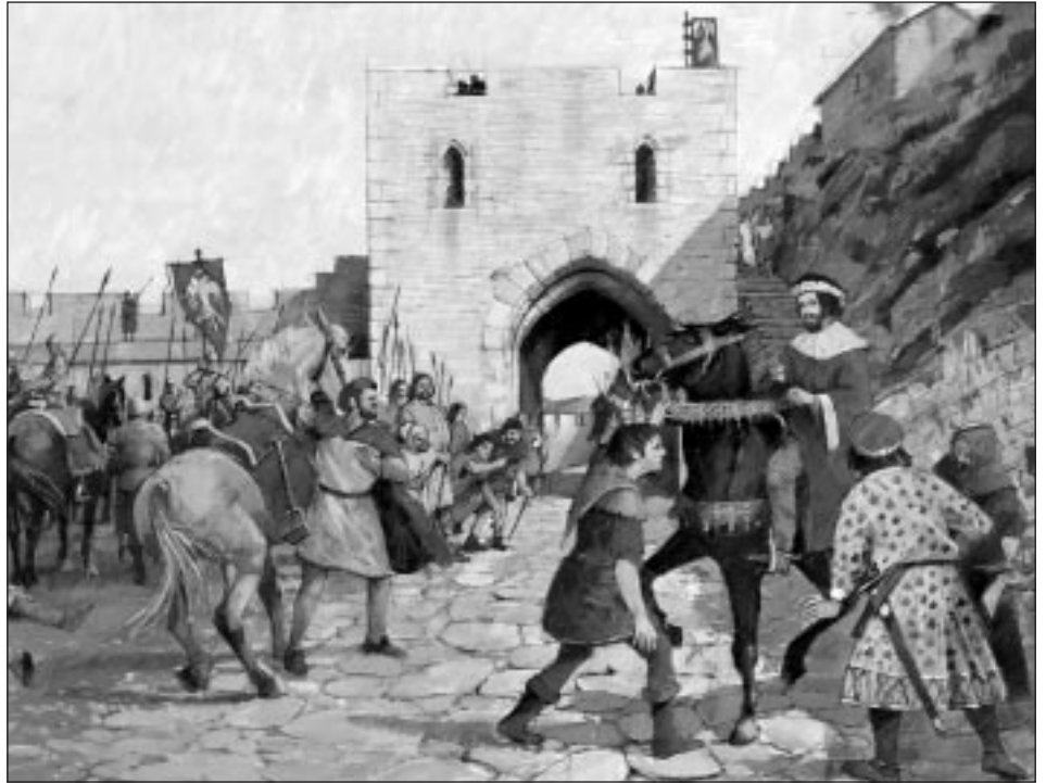
Reconstruction drawing of the gateway and Mainland Courtyard of the Medieval castle.

Pupils could be asked to concentrate on the natural environment of Tintagel Castle and provide words that describe the physical location. They can be guided to different themes – coastal features (rocky, crags, stacks, inlet, sea, cave, waves, sand), wildlife (birds, flowers, grasses) and the weather (sky, sunny, bright, dull, rain, windy).