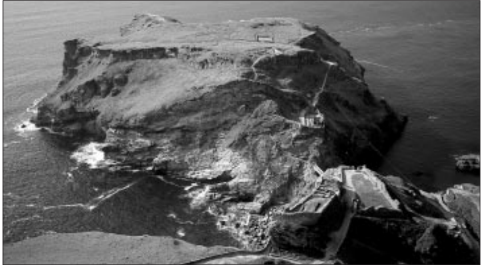
Tintagel Castle, Cornwall.

This booklet aims to help teachers to plan a visit to Tintagel Castle as part of a history study at key stages 1 to 4. A visit will allow pupils to identify more readily with the events and consequences of actions in the past whilst developing their knowledge, skills and understanding through historical enquiry and historical interpretation. It will also support a range of National Curriculum subjects such as geography and work in literacy.