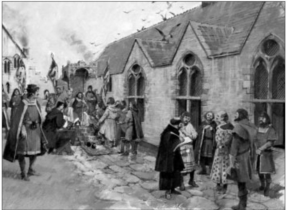
Reconstruction drawing of the Island Courtyard of Earl Richard's castle.