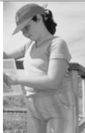
Well Supply of fresh water Surrounded by salty water