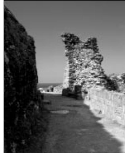
Entrance Narrow passageway High thick stone walls Cliff and crags Gatehouse Drawbar slots for wooden door Ditch

TEACHER INSTRUCTIONS: The aim of this activity is to ask your pupils to assess the medieval defences of the castle by using detailed observation and questioning. Read the task to your pupils in school or before you arrive at the castle entrance. Tell pupils they are to be in a position to report back to their teacher. If you have a large group of pupils, it is advisable to divide them into smaller groups, each accompanied by an adult who can record their group's ideas. Each group should visit the eight locations shown on the plan below and use their 'spy-eyes' to identify the castle's strong and weak defences. Use the photographs to guide your pupils to the main defensive features. Then use questions and answers to help them identify the feature and to assess whether it was a strong defence or a weak one. When you have completed all eight locations, ask your pupils if they would recommend that their master attack the castle, and give reasons.