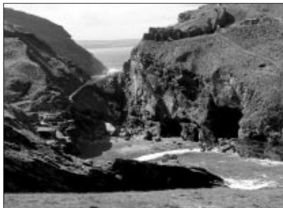
Bridge Narrow strip of land Cliffs Location above beaches