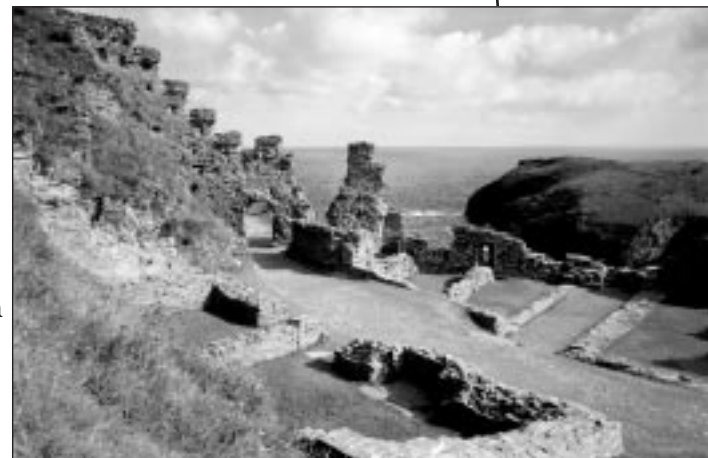
Island courtyard Battlements Thick stone walls Island location Level terrace Great hall Arched entrances