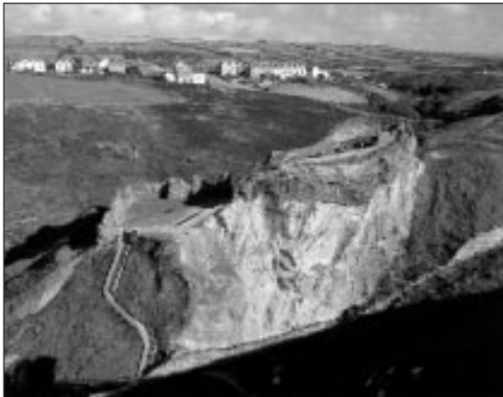
Mainland courtyard Battlements Thick stone walls Square towers Buttresses Steps to walkway