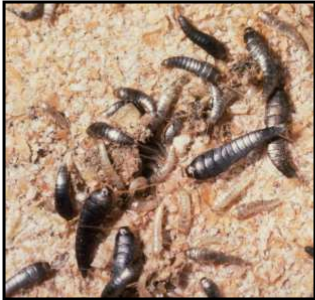
Adults and nymphs on food

The adults will run around very quickly when disturbed. They will only lay eggs in damp conditions and the nymphs live in or very close to damp food where they feed and grow. The length of the life cycle is normally 6 - 12 months depending upon the temperature, humidity and the nutrition of the food.