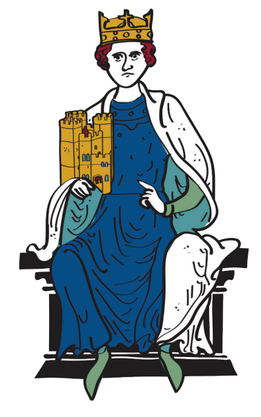
An illustration of Henry II, the king who built Orford Castle.