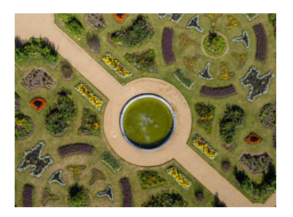
The landscape has been heavily designed by gardeners, with lots of flowers that aren't native to the area.