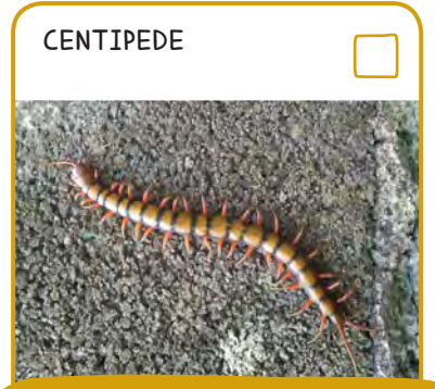
Most centipedes don't actually have 100 legs. They have two legs per body segment and they all grow to different lengths.