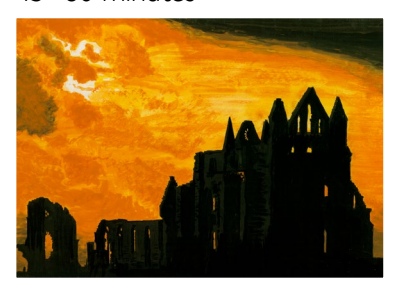
A silhouette painting of Whitby Abbey by an unknown artist.