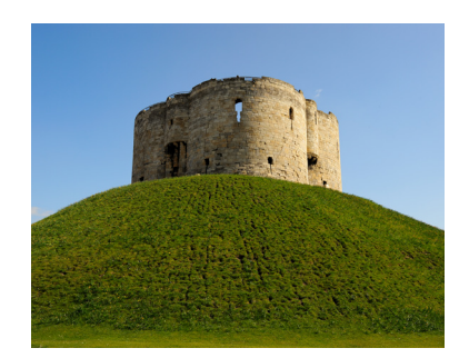
A view of Clifford's Tower from the southwest.