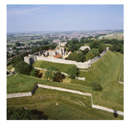
An aerial view of Carisbrooke Castle, showing how the castle is on high ground overlooking the town.