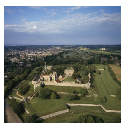
An aerial view of Carisbrooke Castle, showing its proximity to the coast.