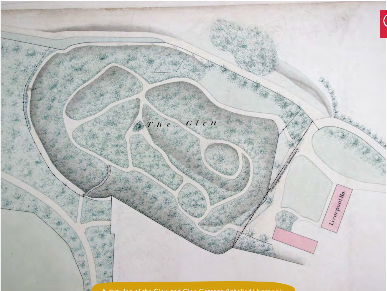
A drawing of the Glen and Glen Cottage (labelled Liverpool House in error) in 1860.