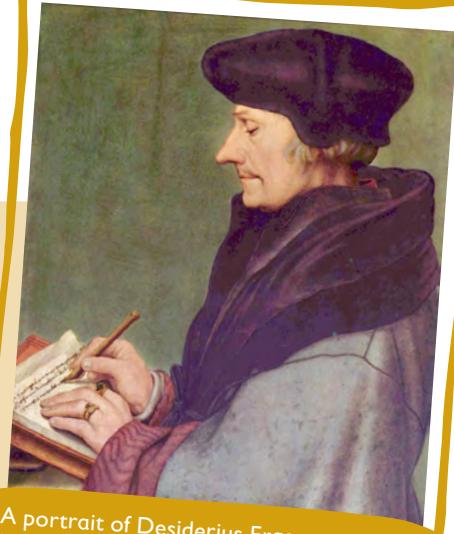
A portrait of Desiderius Erasmus painted by Hans Holbein the Younger in 1523.