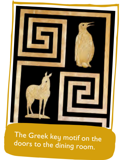
The Greek key motif on the doors to the dining room.

Can you find Art Deco design in Eltham Palace? Search for the things below: