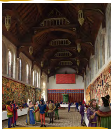
A reconstruction illustration of the great hall in the 15th-century.