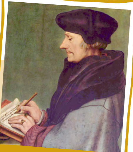
A portrait of Desiderius Erasmus painted by Hans Holbein the Younger in 1523.