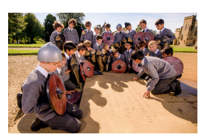
Gathered students taking part in the 1066 Conquest Tour and Tales session at Battle.