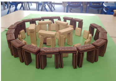
Example of a biscuit henge made by a Year 3 class at St Mary's Catholic Primary School, in Swanage.